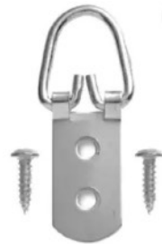
Two holes up to 75 lbs

Attach hangers to the back of the art piece close to the edge with the provided screws.