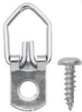
One hole up to 25 lbs

Attaching the wire to the artwork is done using small hardware pieces, either “eyes” or a “D ring hanger”. The “D ring hanger” is preferred as it comes in several different sizes which equates to how much weight it can hold. There are several brands available. OOK brand is available at Home Depot, Lowes and Hobby Lobby. Select which one to use based on the weight of your art.